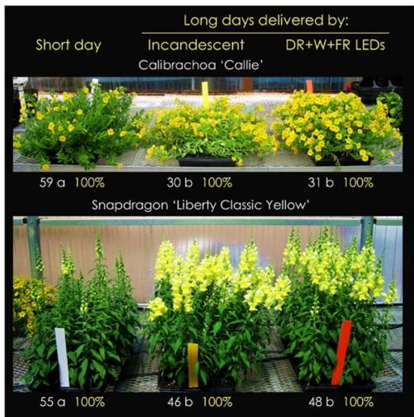
Figure 2. Calibrachoa and snapdragon grown under natural short days without or with a 4-hour night interruption from incandescent or the Philips deep red + white + far red (DR+W+FR) LEDs at the Center for Applied Horticulture Research at Altman Plants. Average days to flower followed by different letters (in white font) are significantly different. Flowering percentage is in yellow font.

Krueger-Maddux Greenhouses —All plants flowered similarly under the INC lamps and LEDs except for >>>