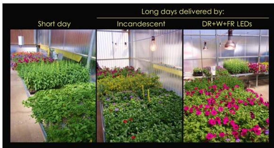
Figure 1. Setup of treatments, including a natural short day and a 4-hour night interruption from incandescent or the Philips deep red + white + far red (DR+W+FR) LEDs, at the Center for Applied Horticulture Research at Altman Plants.

The 14-watt DR+W+FR LED lamp was developed as a commercial replacement for 100 or 150-watt incandescent lamps used for photoperiodic lighting. The DR+W lamp was developed for crops that don't