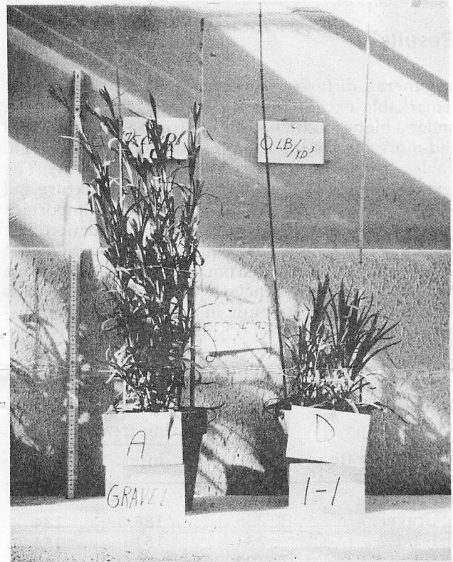
Figure 3. Extreme effects of water, soil, and Hydrogel treatments during first crop planted Nov. 6, 1972. Gravel watered twice daily with 7.5 lbs Hydrogel per cubic yard, 1-1 mixture of wood chips, and soil watered every 4 days with no Hydrogel.